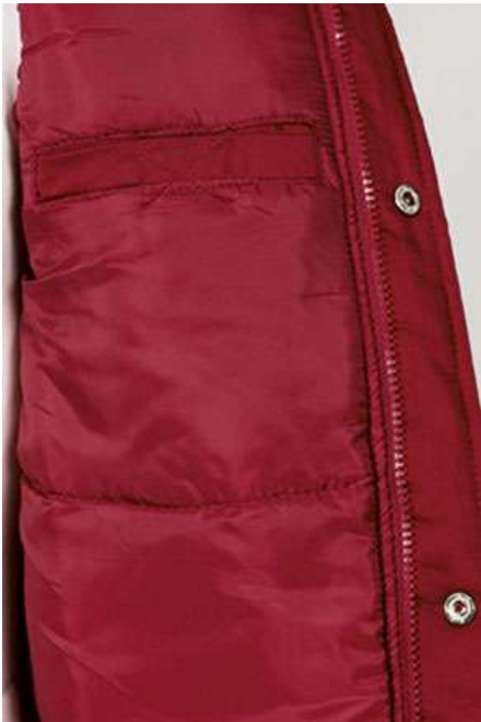
Lateral view: prolonged back part