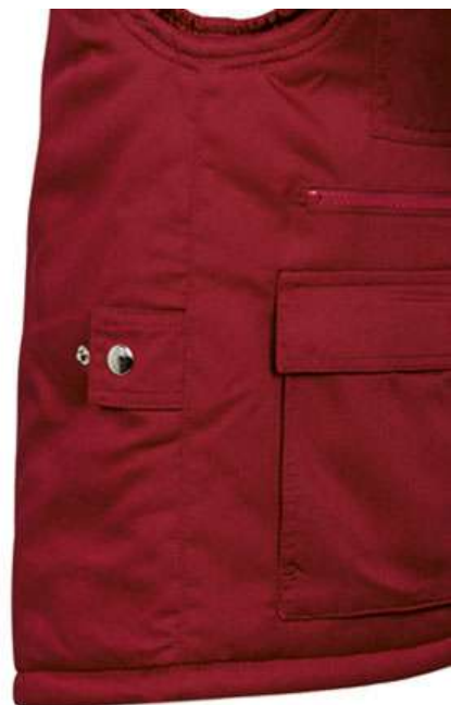
Lateral view: prolonged back part